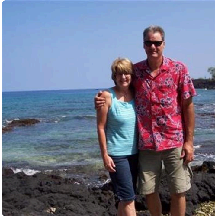
His two loves, my sister and Hawaii